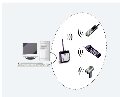
Wedge emulation interface for PDC basic line RF terminals