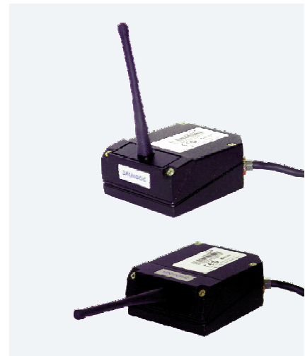
Adjustable antenna for easy installation

OPERATING TEMPERATURE -10° to +50 °C / +14° to +122 °F STORAGE TEMPERATURE -20° to +70 °C / -4° to +158 °F HUMIDITY 90% non condensing ENVIRONMENTAL PROTECTION IP64