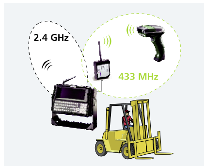
Fork-lift truck terminals with Datalogic RF readers